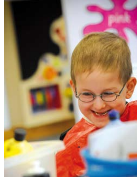
Left: Visual Art has a unique place in our curriculum